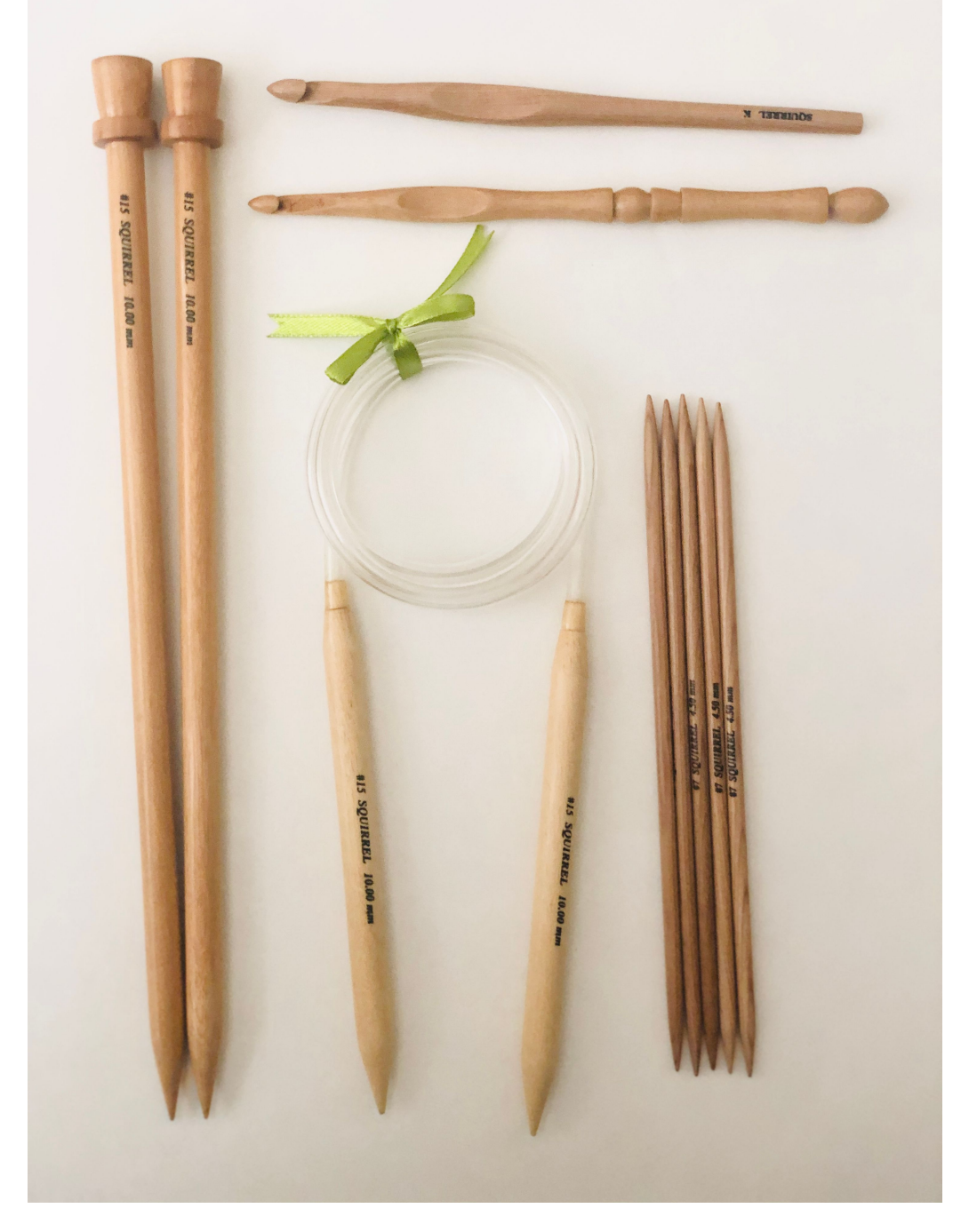
White Wood Elegant yellow wood-tone color