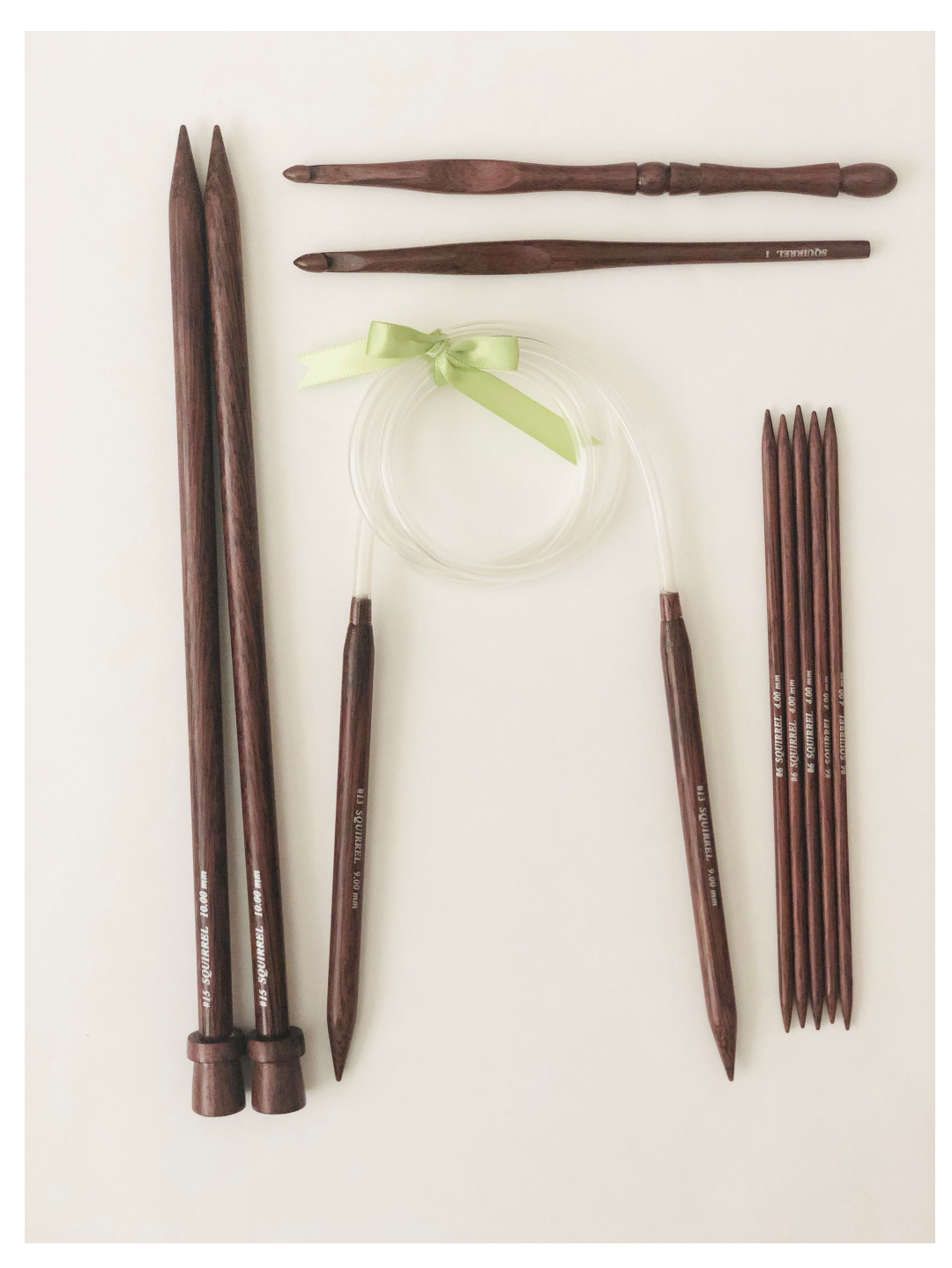
Rose Wood Classy cherry-red wood