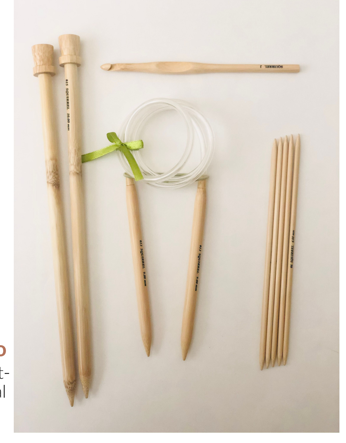
Bamboo Eco-friendly, light-weight material