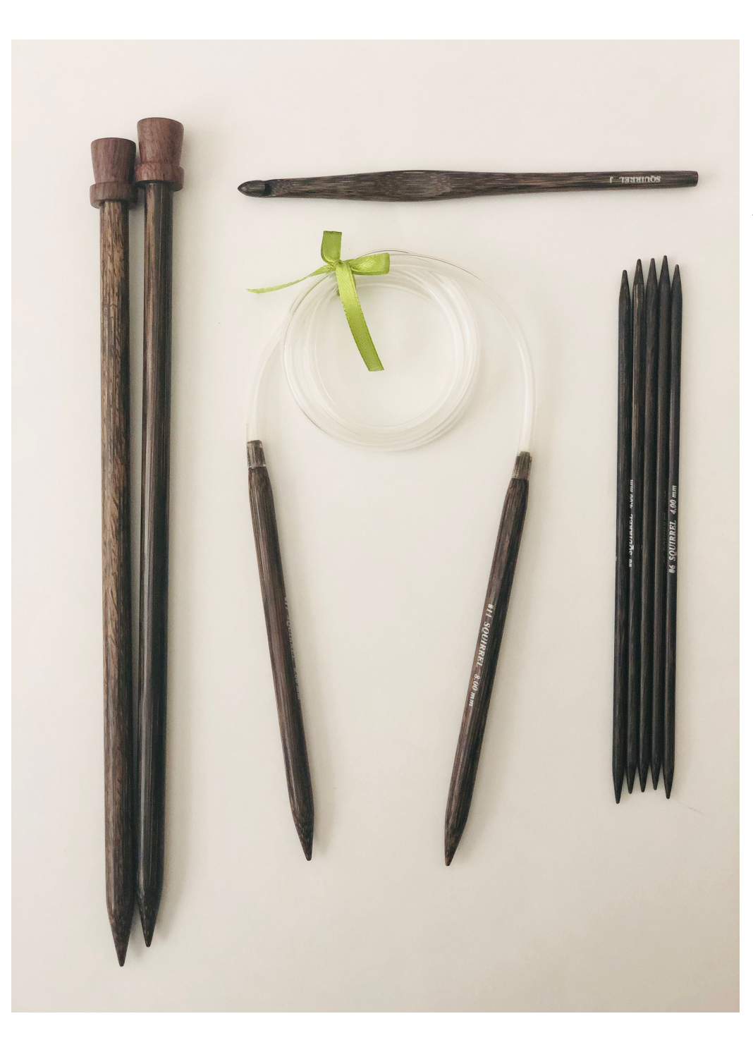
Palm Wood Marvelous dark wood with contrast wood grain